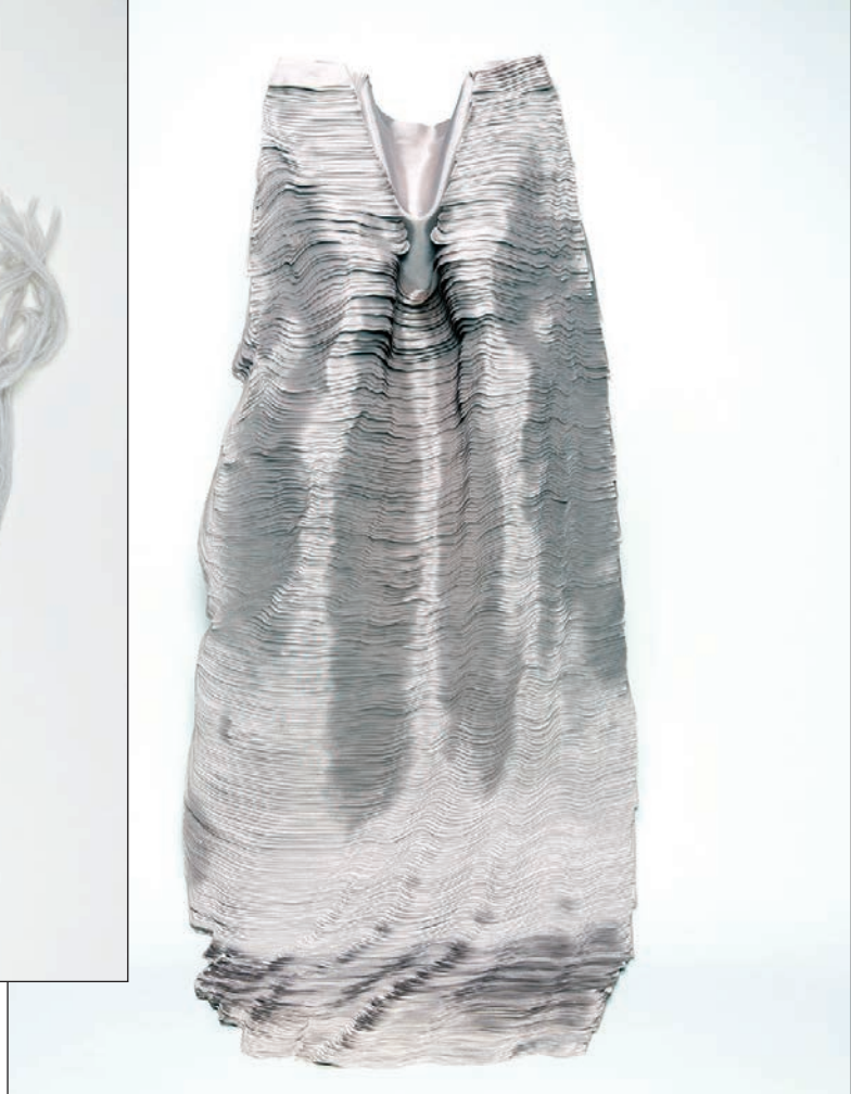
LEFT: EMILIE PALLARD AND NIELS HEYMANS Casting Spells (helmet) Gold embroidery on braided natural leather, 4.3" x 8.6" x 8.2", 2012. CENTER: EMILIE PALLARD AND NIELS HEYMANS Casting Spells (plastron) 100% woven Mohair, 100% polyester embroidery, RVS laser-cut metal, 14.1" x 17.7" x 19.6", (with mohair strings: 39.3" x 14.1" x 19.6"), 2012.