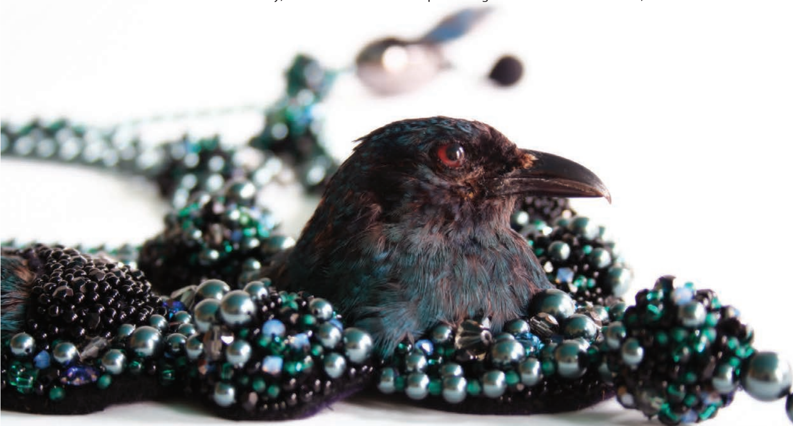
AFKE GOLSTEIJN (collaboration with FLORIS BAKKER ) Bird Necklace (from the Jewellery collection) Bird head and wings and, beads, gems, thread, taxidermy, beading, stitching, 2008.

Hoitink uses mycelium , the roots of mushrooms, and lets them grow on a mould into a biodegradable tissue. The fungal material is an alternative to synthetics with several advantages. The final garment is built out of modules that can be replaced or grown to the wearer's wishes, such