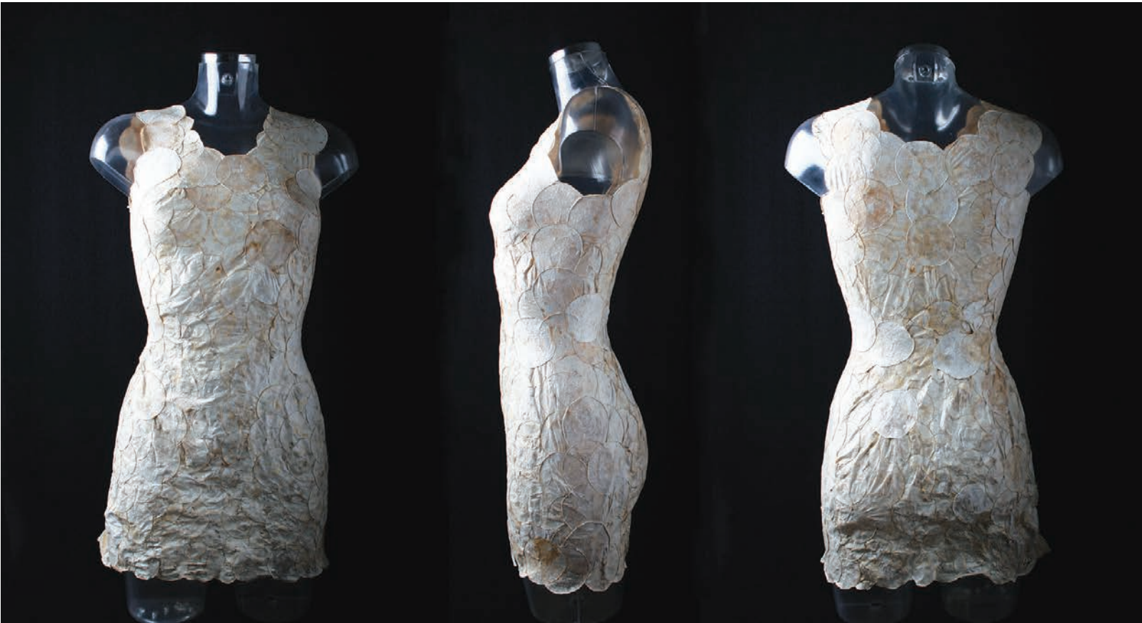
ANIELA HOITINK MycoTex Dress 350 self-adhering discs made of 100% mycelium (mushroom roots) textile, 2015. MycoTex mycelium textile disc sample BELOW .